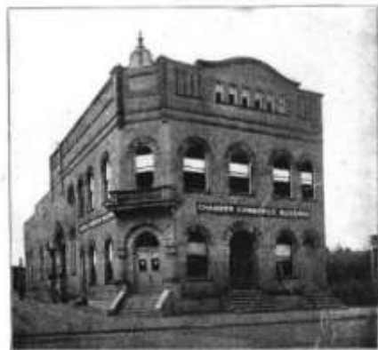
CHAMBER OF COMMERCE

The Board of Trade organized on April 30, 1887. On January 27, 1915, a general meeting of the Board of Trade, the Merchants Association and general business interests assembled for the purpose of organizing a chamber of commerce. On February 4, 1915 the Merchants Association agreed to merge by a small majority.