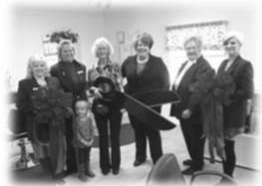
The MACC Ambassadors celebrated the opening of Shear Perfection , Marietta's newest hair salon, located at 710 Lancaster St.

Thank you for being a partner in this program which has kept more than $2 million dollars in our local economy in the past decade.