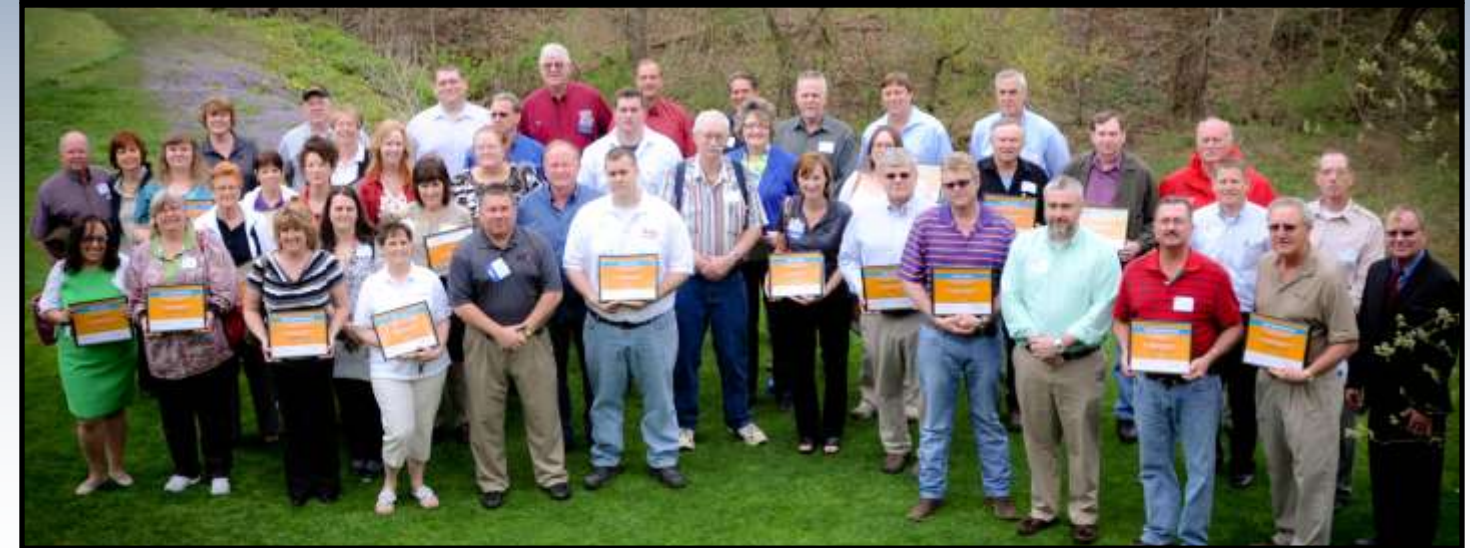
The MOVSC and the Ohio BWC recognized 80 companies at the annual awards luncheon at the Marietta Country Club in April. Pictured above are the 100% Award winners. This award is given to each company that works the entire year (2012) without a lost-time injury or illness. See the MOVSC Awards flyer for more pictures and a company award listing.