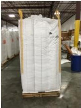
BAFFLE TYPE "C" FIBC