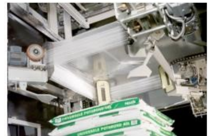
STRETCH HOODER FILM