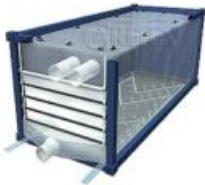
SEA-BULK CONTAINER LINERS