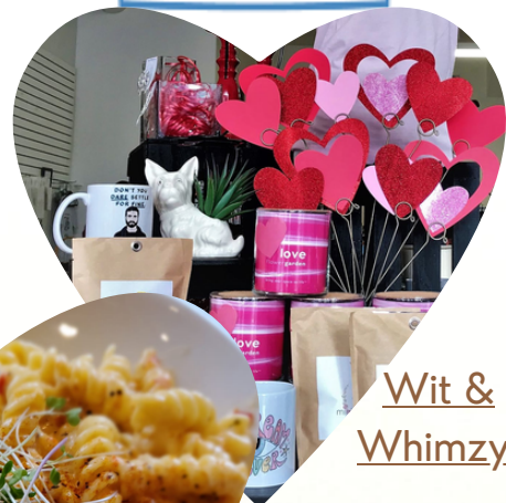
Wit & Whimzy