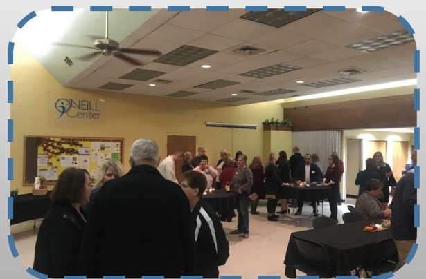
It was a full house in the at the O'Neill Center!