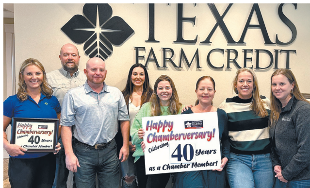
Texas Farm Credit 40 Years

The Blue Blazers have begun celebrating our member’s “Chamberversaries” by surprising them with Celebration Visits and thanking them for their investment.