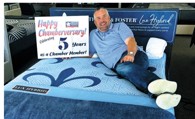
Mattrezz Guys 5 Years

Walk-In’s Chamber of Commerce 642 Website – www.BrenhamTexas.com Unique Visitors 6,347 Total Pages 3,112