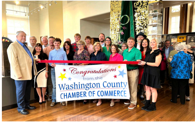
Maifest Exhibit – Brenham Heritage Museum 105 S. Market St., Brenham