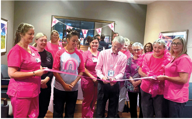
Baylor Scott & White - The Brenham Clinic Hasskarl-Giddings Imaging Center 20th Anniversary | 693 N. Market St., Brenham