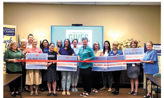
2023 Brazos Valley Gives Kick-Off – Washington County Non-Profits