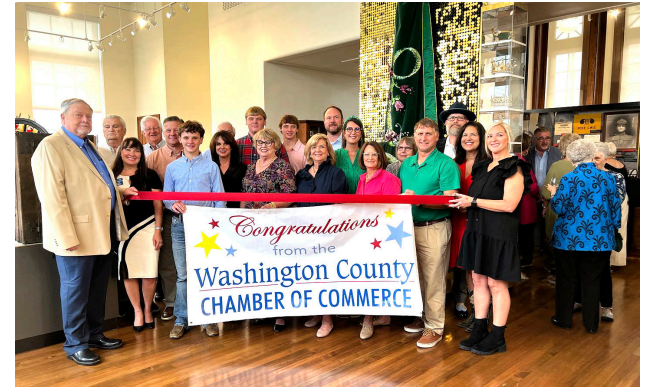
Maifest Exhibit – Brenham Heritage Museum 105 S. Market St., Brenham