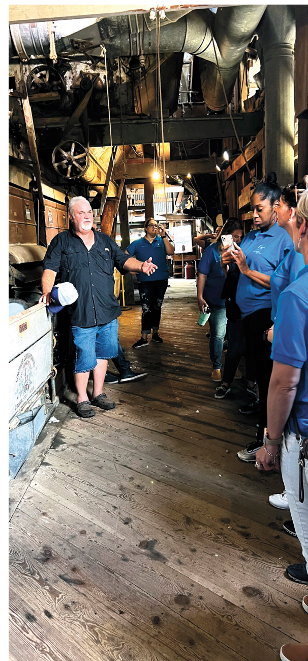
The class touring the Texas Cotton Gin Museum in Burton

The October session of Leadership Washington County included a look at local history.