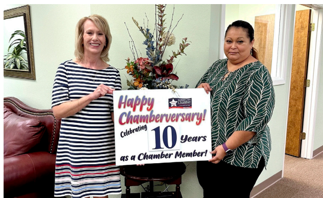
Washington County Insurance Agency 10 Years