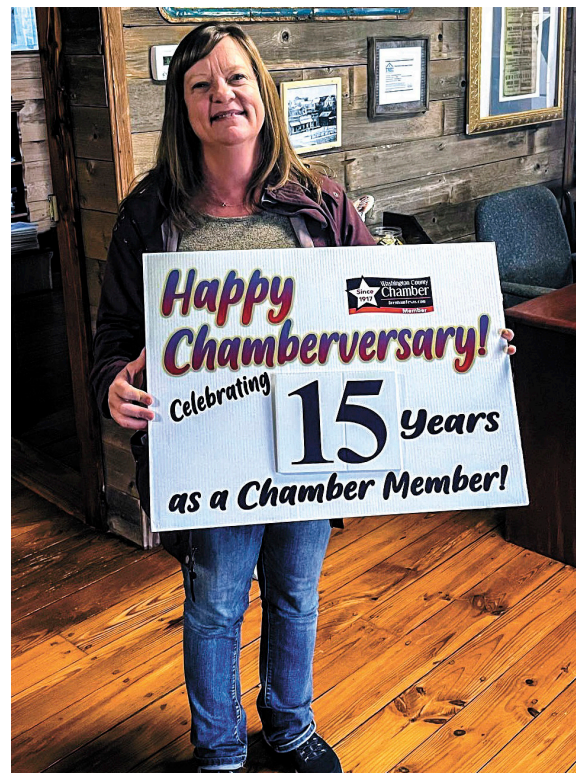
Burton Heritage Society 15 years