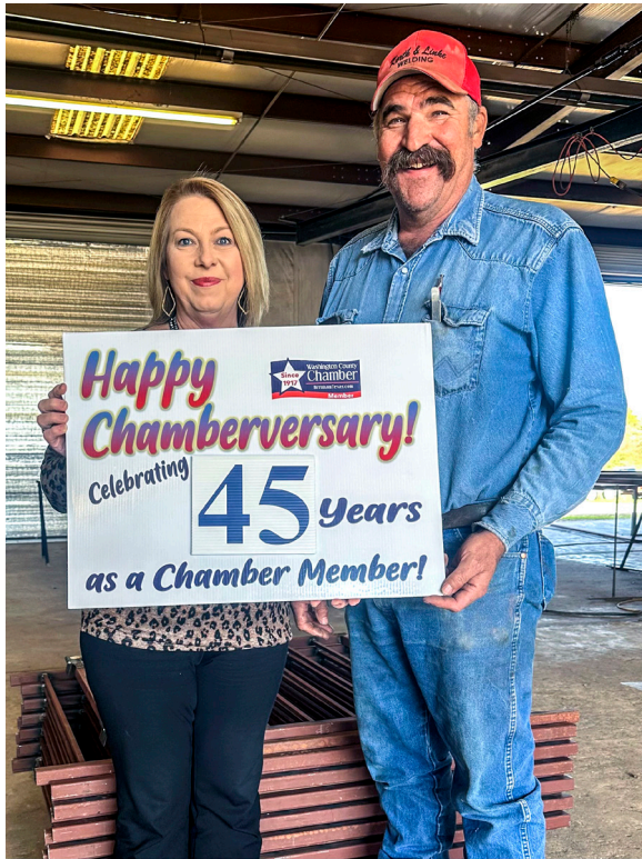
Korth & Linke Welding 45 years

The Blue Blazers have begun celebrating our member’s “Chamberversaries” by surprising them with Celebration Visits and thanking them for their investment.