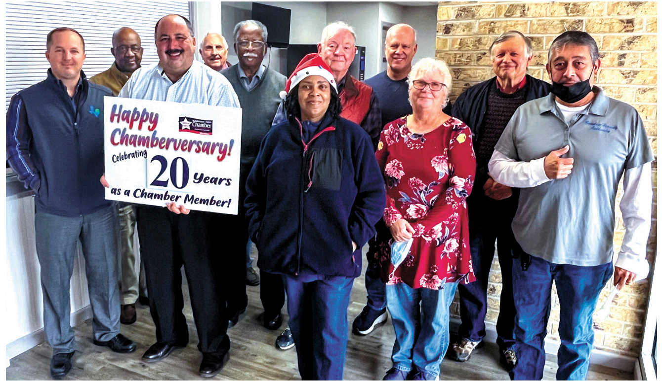
Brenham Housing Authority 20 years