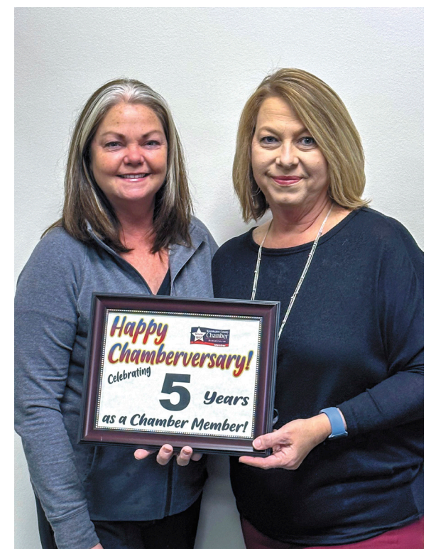
Kmieciak Construction 5 years