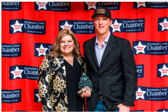
Brenham Quality Meat Market