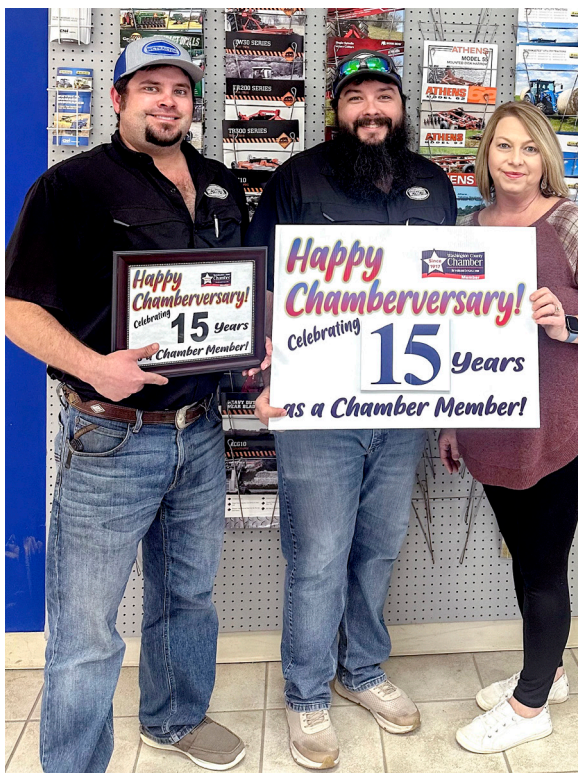
WCT Outdoors 15 years