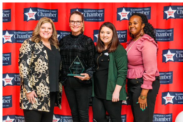
Brenham Pregnancy Center