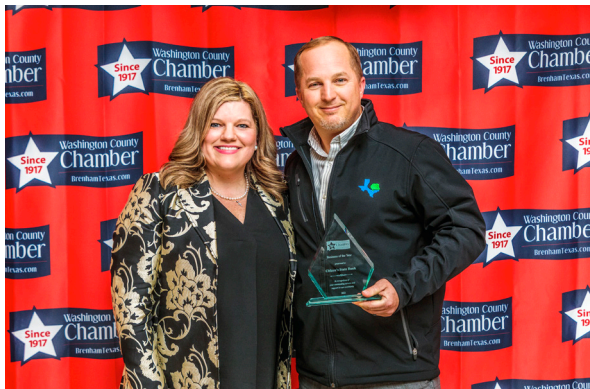
Citizens State Bank