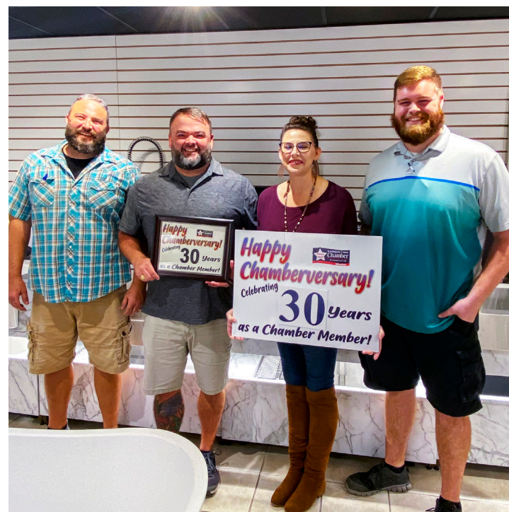
Moore Supply Co./The Bath & Kitchen Showplace 30 years