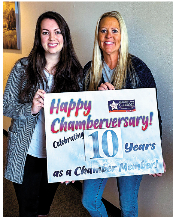
Century 21 and We Manage Properties 10 years