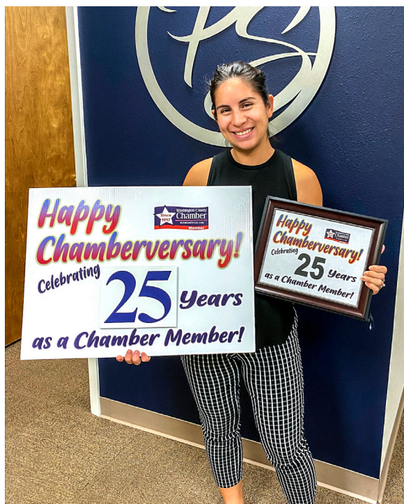
Personnel Services 25 years