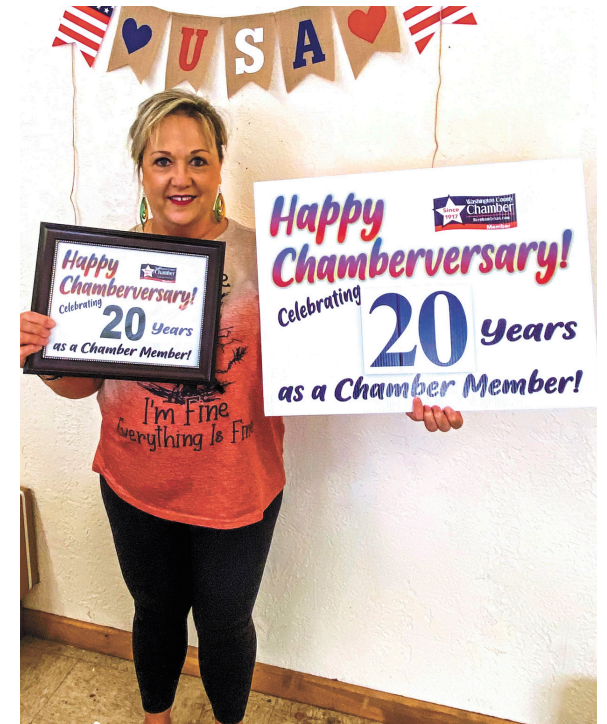
Webb Printing 20 years