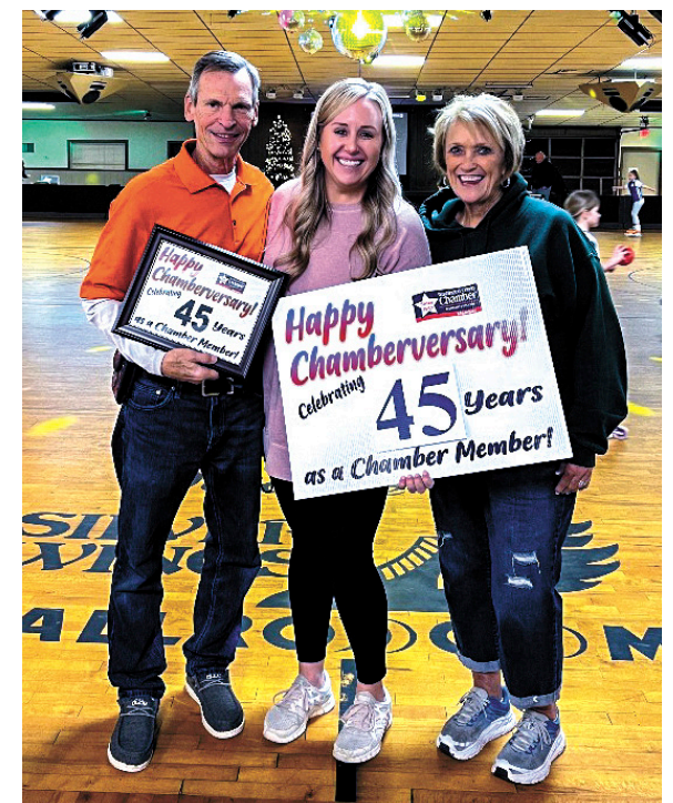
Silver Wings Ballroom 45 years