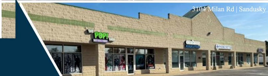
3104 Milan Rd | Sandusky