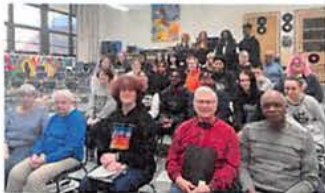
Sandusky High Schools Inter-generational Choir – Ageless Harmony