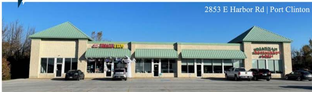
2853 E Harbor Rd | Port Clinton

Some properties are owner/agent listings.