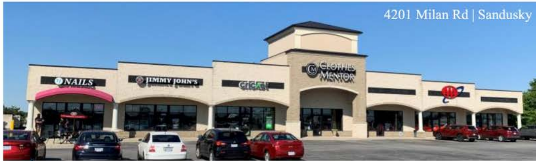
4201 Milan Rd | Sandusky