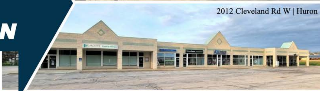
2012 Cleveland Rd W | Huron