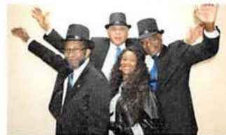
The J-Markz – Surprise performance