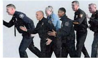
Perkins, Sandusky, Berlin Hts, Huron Police and the Sheriff as “The Rookies”