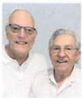
Harmony, Inc. as The Eagles sing – “Easy Peaceful Feeling”