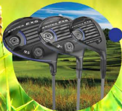
Touredge EXS Driver, 5 Wood, and 3 Wood