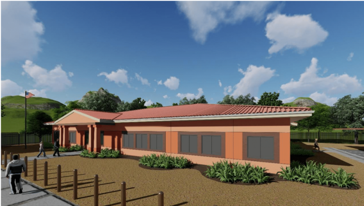
Design drawing for the planned Rio Office Building, provided by MKL Architecture PC