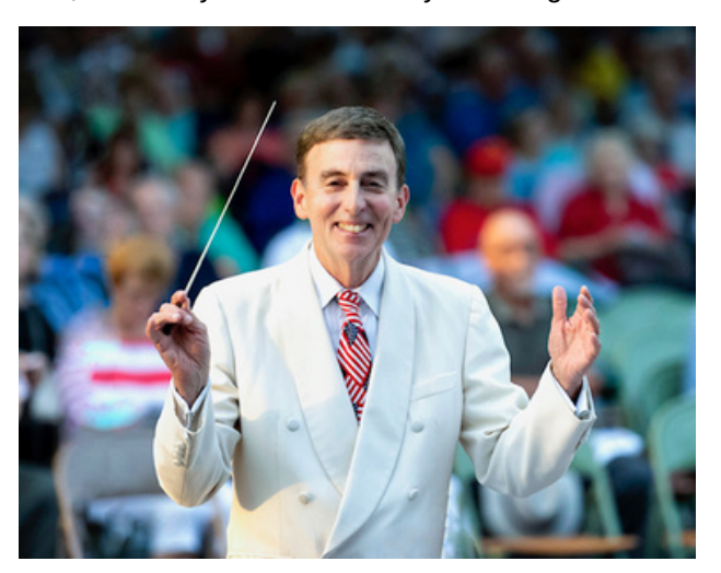
CARL TOPILOW, CONDUCTOR