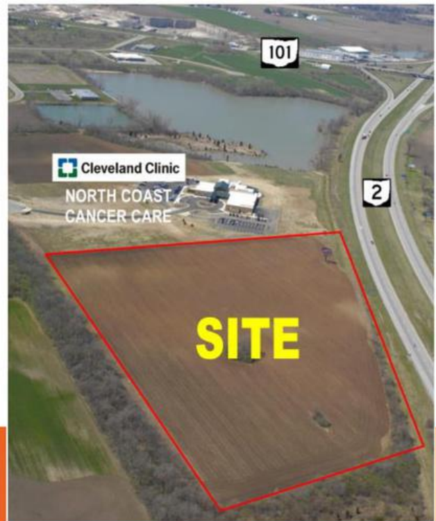
*Properties shown are owner/agent listings.