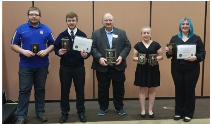
2022 event held at the Holiday Inn Hotel & Convention Center

The Agri-Business Committee of the Portage County Business Council invites Business Council members and their guests to the 2023 American Agriculture Appreciation Banquet on Monday, March 6th.