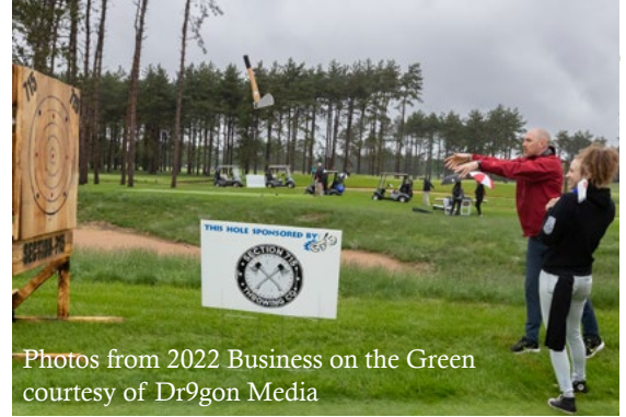
Photos from 2022 Business on the Green

You have a great opportunity to be further involved in Business on the Green event scheduled for Monday, June 5th by taking advantage of a sponsorship! Don't miss this!