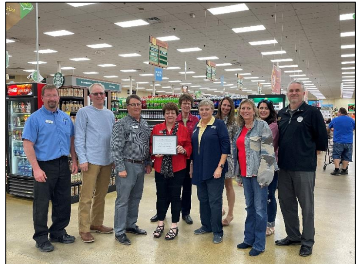
Business After Hours