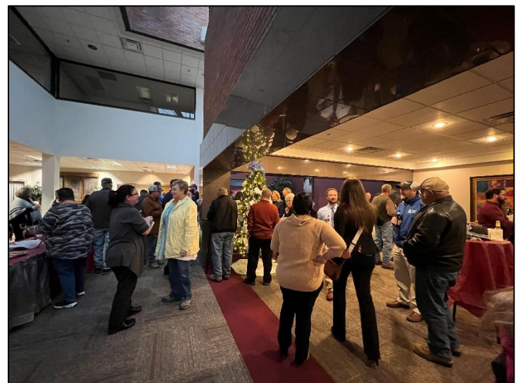
Networking opportunities year-round