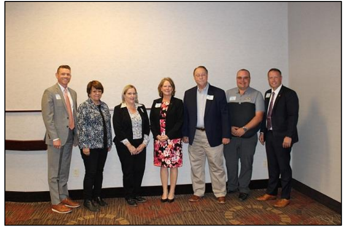
State of the Valley

Ambassadors (billed in January)..... $35/year One Name & One Category Listing..... No Charge Listing are alphabetical by business name and category. Additional Category Listing..... $25/year Listing your multiple business services as an additional category (billed in August). Enhanced Web Listing..... $50 (one time fee)