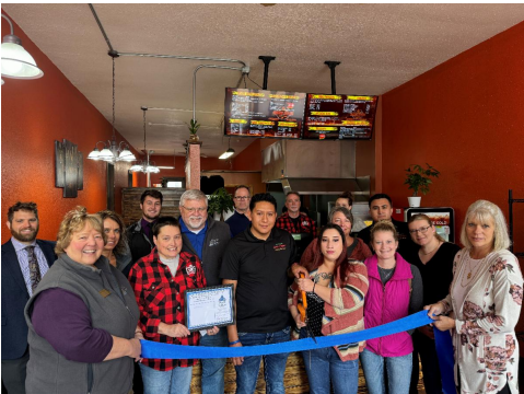
Smoke House TX BBQ is a new restaurant in Merrill. They are located at 722 E 2nd Street. If you haven't tried their food yet, you're missing out!