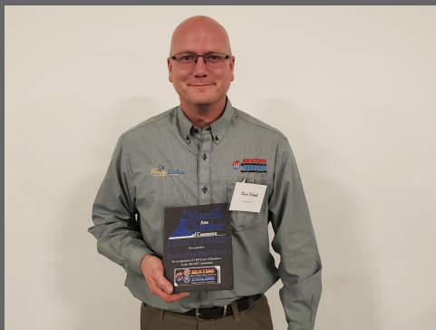
Merrill Sheet Metal Works For 110 Years of Service in Merrill