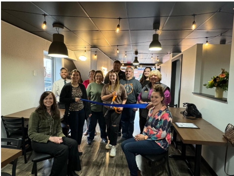
Auntie Ray's Coffee House has expanded into the building next door. This new expansion provides more room for customers to come and enjoy their food and beverage.