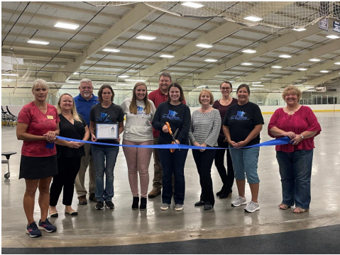
Merrill Ice Reflections Figure Skating Club held a ribbon cutting to commemorate the club becoming a Full U.S. Figure Skating Member Club.