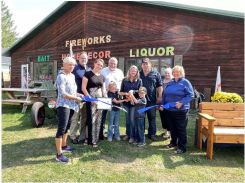
Old Time General Store and Mercantile in Gleason, has new owners and they became members of The Chamber. We held a ribbon cutting to celebrate this new adventure for them!