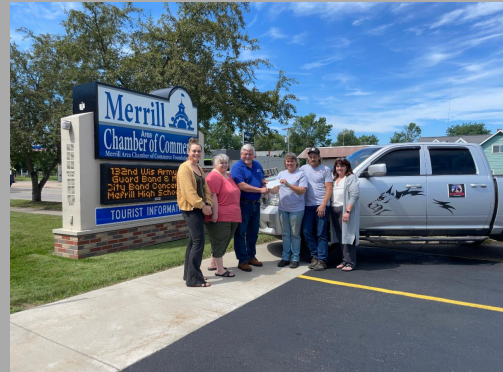
Apex Angels & Warriors Veteran/Wolfdog Healing and Education Center

We had a great day! We had 34 teams golfing. Thank you once again to ALL of our sponsors, donators, and volunteers! It couldn't have gone so well without you. We raised $800 from our portion of the 50/50 raffle this year and we donated it to four local nonprofits. They are pictured here with the check presentation.