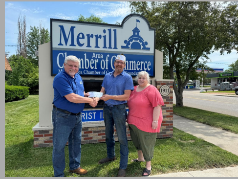
Northwoods Veterans Post