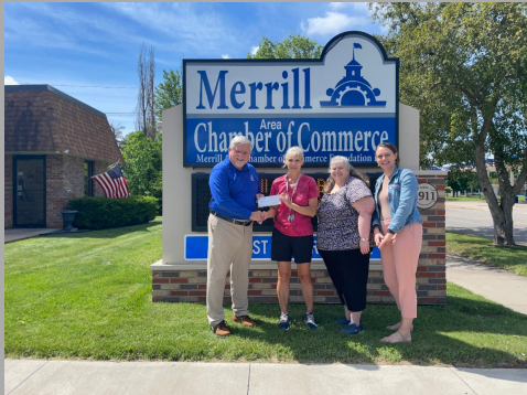
Little Lakes Memories