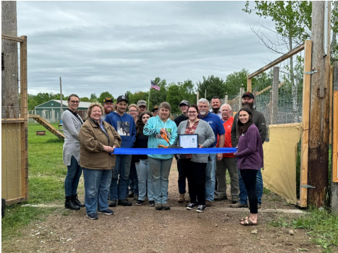
Apex Angels & Warrior Veteran/Wolfdog Healing Center