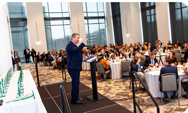
Lieutenant Governor Husted giving the Keynote Address at the 2024 EEA's