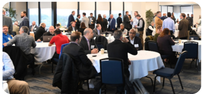
ACEC Ohio/AIA/OFCC Partnering Conference