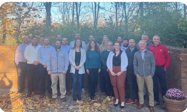
2023-2024 ACEC Ohio Rising Leader class