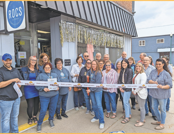
ROCS Community Closet-Mitchell Wed., April 19