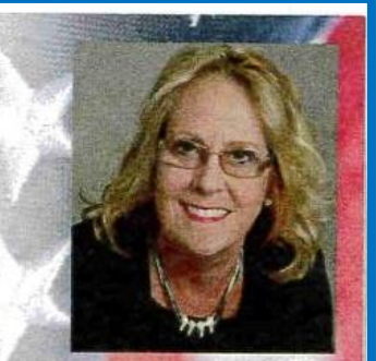
www.MFGLends.com NMLS # 219650

THutto@MFGLends.com 352-552-7801 Cell/Text