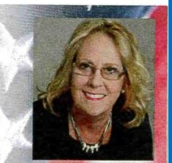
www.MFGLends.com NMLS # 219650

THutto@MFGLends.com 352-552-7801 Cell/Text