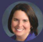
Senator Kelli Stargel