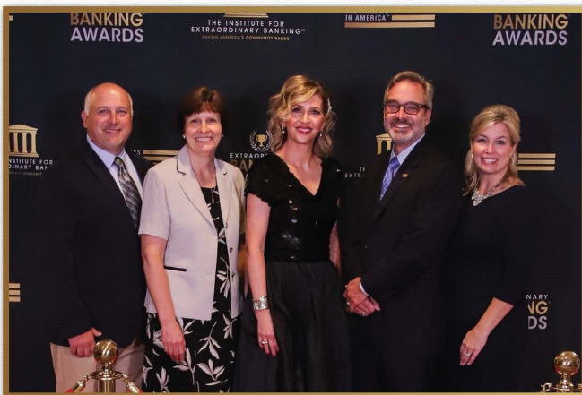
RECOGNIZED AS ONE OF THE TOP 50 EXTRAORDINARY BANKS IN THE NATION - INSTITUTE OF EXTRAORDINARY BANKING