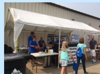
Volunteers cooking & serving hotdogs, brats, water, pop & chips