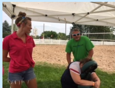
Great River Spine & Sport providing back, shoulder & neck relief to the weary!

At left, Klein Bank staff awarded $10 gift certifications to youth who made the Hole in ONE!