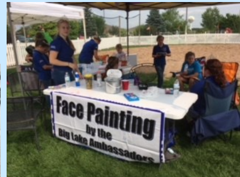
Big Lake Ambassadors painting faces of excited youth!