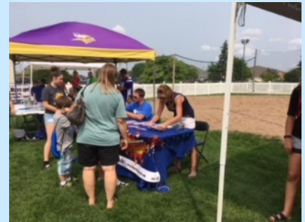
Sherburne State Bank helping youth with their favorite SuperHero face

Community Sponsors: Big Lake American Legion Auxiliary Unit 147, Big Lake Beyond the Yellow Ribbon, Blue Bunny Ice Cream, Edward Jones, & Loch Jewelers, .