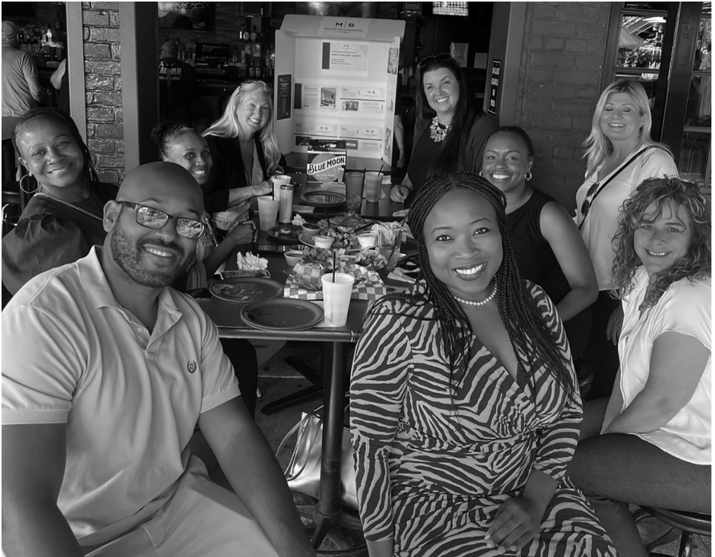
The D&I Committee at a Recruiting Mixer on June 21, 2023 at Madison's in Mount Clemens