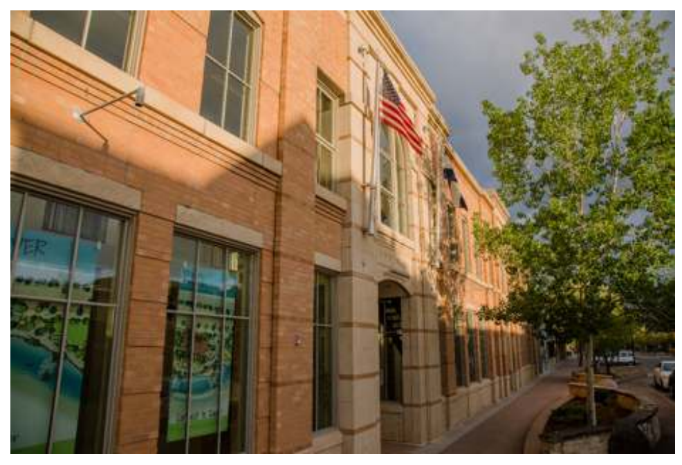
Town Hall is located at 200 Broadway at the corner of Broadway and Second Street. Office Hours are Monday – Friday 8 am to 5 pm and we are closed on holidays.

Town of Eagle is one of western Colorado's best kept secrets – a hidden gem with pristine and abundant access to epic and nearly untouched mountain biking, trail running and hiking, year-round events and Gold Medal fly fishing. Surrounded by BLM, state parks and open space lands, we invite you to Discover New Terrain.