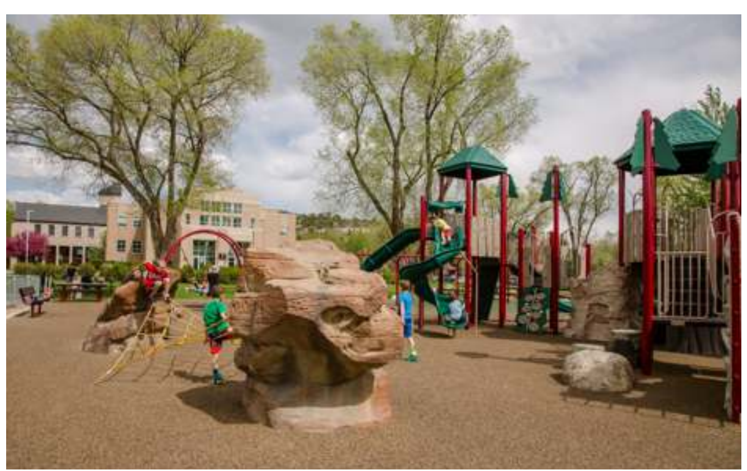
Eagle Town Park 2018

Recreation Center, and Edwards Field House. For full facility and activity listings visit https://mountainrec.org/.