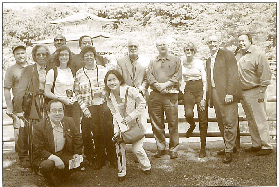
● The Jikei Group of Colleges hosted the Presidents' Visit to Japan in April, 2004. The delegation gained a comprehensive understanding of the technical and vocational education training programs offered in Japan.

COLLABORATIVE ACTIVITIES is a hallmark of CCID colleges. The organizational chart illustrates both formal and ad hoc committees, by which we work together to meet our goals.