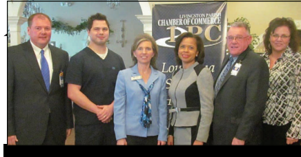
Hospital CEO's address the Chamber on the Affordable Care Act

sources, Babcock Insurance, Henry Powell Wright & Percy, BHAA, First Guaranty Bank, Skid Marks, Lard Oil Company Topics included discussion on the health care changes, parish growth, parish crime, education in Livingston Parish and economic impact.