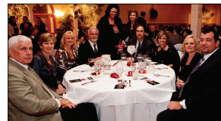
Players at the Chamber's Golf Tournament and just a few of the stars at the Chamber Gala!