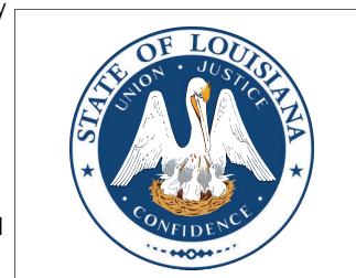
Governmental Affairs / Your CHAMBER your advocate!

Northshore Focus day at the Capitol, Leadership Power Breakfast, Second Home Legislative Reception, NLA legislative conference & the US Chamber of Commerce Governmental Affairs Conference.