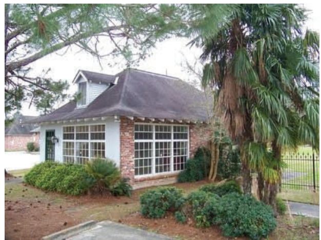
Chamber's New Building

make a historic purchase and closed on the future home for the Chamber at the end of December, 2013.