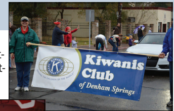
2013 Denham Springs Christmas Parade

The Kiwanis Club of Denham Springs looks forward to hosting the Denham Spring Christmas Parade in 2014.