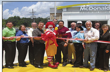
McDonald's in Albany