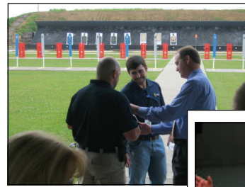
Criminal Justice Day

Mighty Moms received $20,000 through the group projects efforts and an extensive barrel program collected food items. The Chamber