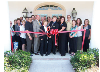
First Guaranty Bank in Watson Ribbon Cutting

Leads for Lunch is going strong averaging 55-60 per luncheon. All chamber events, ribbon cuttings, etc. are open to the membership!