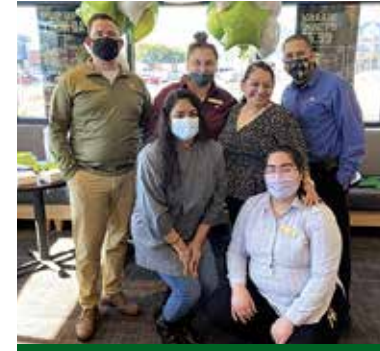
Our Staff, Ambassadors, & Members joined the team at Panera Bread to connect over lunch. Deliciously fresh sandwiches, salads, drinks, and pastries were generously provided by the wonderful staff at Panera Bread.