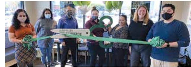
Grand re-opening of Panera Bread at Northridge Mall. The Salinas Panera Bread opened just before the pandemic, for most of 2020 they were only able to operate their drive through. We were so excited to celebrate their fully opened café.