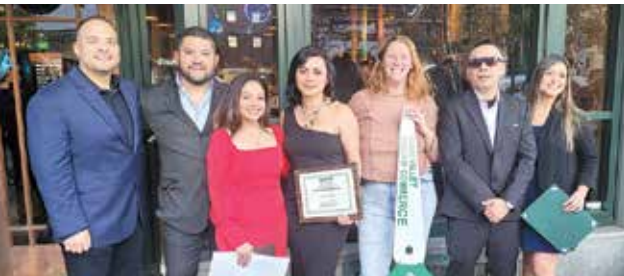
Celebrating this brand-new brewery in Oldtown Salinas. Visiting La Cantina is a hoppin good time, cheers to their success!