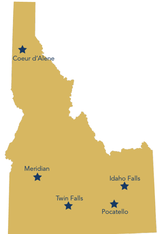
Blue Cross of Idaho district office locations