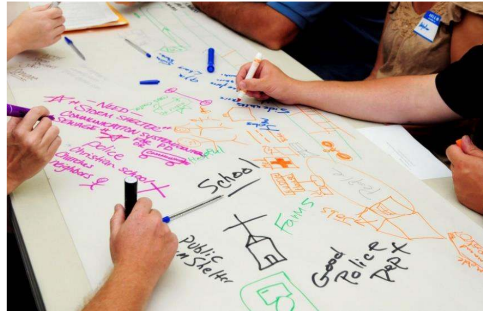
Rainsville, AL, 8/22/11

ATTN: National Mitigation Planning Program Federal Insurance and Mitigation Administration (FIMA), DHS/FEMA, 400 C Street SW, Suite 313, Washington, DC 20472-3020