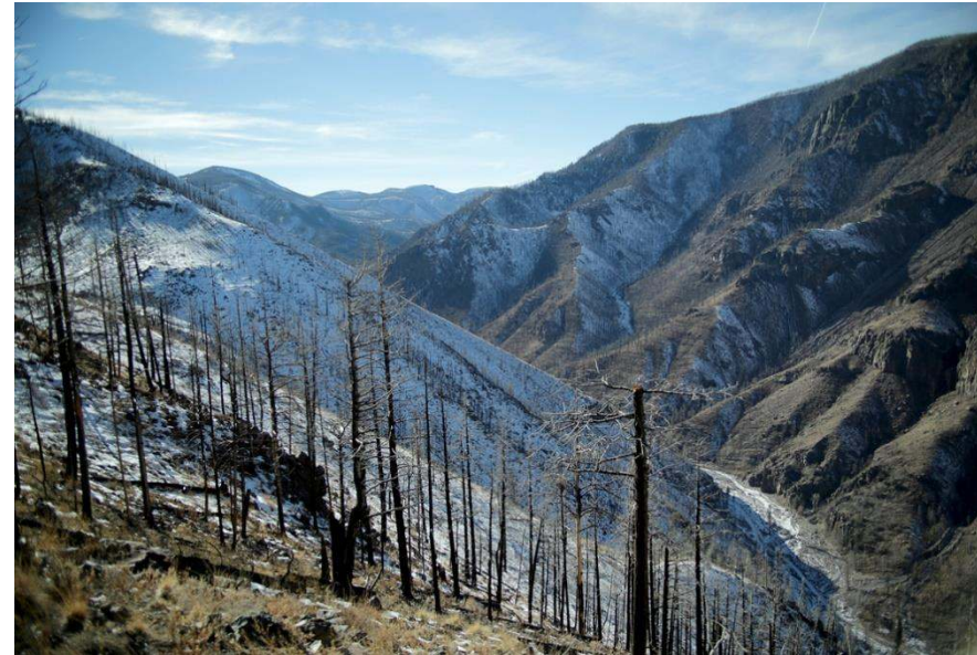
Santa Clara, NM, 12/15/14