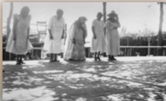
Pala Women Dancers at Fiesta