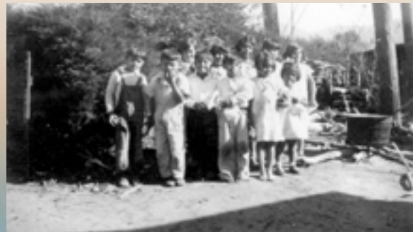
Boys and Girls Portrait at the Pala Day School