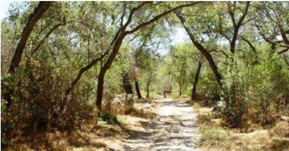
Wilderness Gardens County Preserve