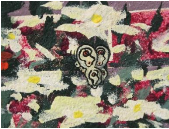
Cat's Eye Marble – on the ground beside the flowerpot