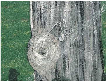
Fishing Hook – stuck in an awning