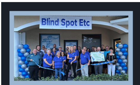
Blind Spot Etc - Ribbon Cutting Charlotte County Chamber of Commerce December 12, 2023