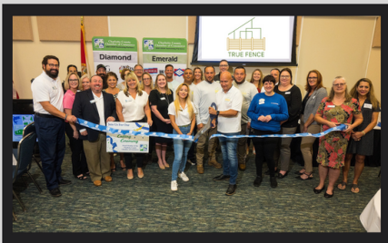
True Fence - Ribbon Cutting Charlotte County Chamber of Commerce November 15, 2023