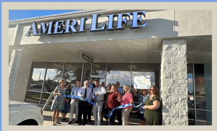
AmeriLife of Charlotte County, LLC - Ribbon Cutting Charlotte County Chamber of Commerce October 4, 2023