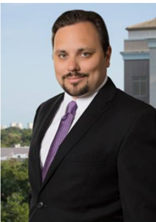
Derek P. Rooney Economic Development Partnership

The new resort is now an activity center in Charlotte Harbor, offering visitors a portal to some of the finest amenities on the gulf coast. These include: A state-of-the-art 7,100-square-foot fitness center and a full-service spa and salon as well as two pools including a 21,000-square-foot adults-only rooftop retreat and 117,000-square-foot ground-level experience (the largest pool in Southwest Florida). The convention area also includes innovative technology and features two waterfront ballrooms fully equipped with best-in-class A/V systems. Accompanying the two clear-span ballrooms are two executive boardrooms, 12 meeting rooms, and an ideation suite with three separate breakout rooms.