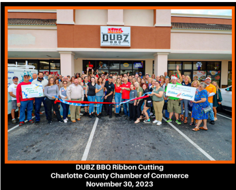
DUBZ BBO Ribbon Cutting Charlotte County Chamber of Commerce November 30, 2023