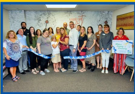
Dandelion Behavioral Health Ribbon Cutting Charlotte County Chamber of Commerce November 9, 2023