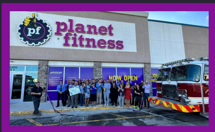
Planet Fitness- Ribbon Cutting Charlotte County Chamber of Commerce October 18, 2023