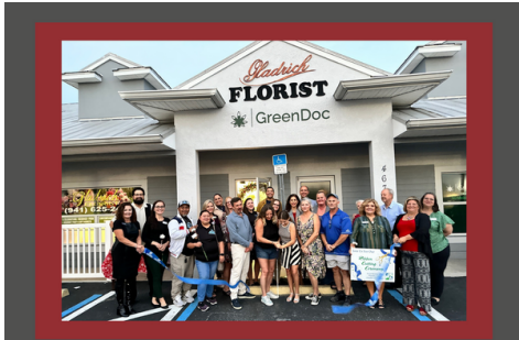
Gladrich Florist - Ribbon Cutting Charlotte County Chamber of Commerce December 5, 2023