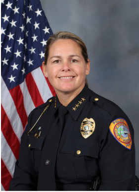
Pamela Davis Chief of Police Punta Gorda

The Punta Gorda Police Department is always receiving reports of scams and we do not expect that change anytime soon. There is little anyone can do to stop these scams from being attempted, but by continuing to discuss and educate people on these issues we hope we can minimize the number of people who fall victim to these awful crimes. Here are just a few of the most common types of scams that we see and ways to avoid them. Please read and share them with your neighbors.