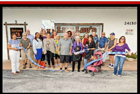
Lily Lou's Specialty Foods Ribbon Cutting Charlotte County Chamber of Commerce October 19, 2023