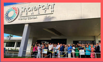
Shorepoint Health Punta Gorda - Ribbon Cutting Charlotte County Chamber of Commerce October 28, 2023