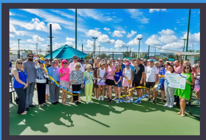
Pickle Plex of Punta Gorda - Ribbon Cutting Charlotte County Chamber of Commerce October 6, 2023