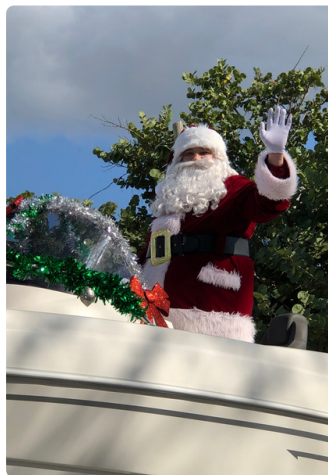
The parade theme was "Tropical Christmas!"