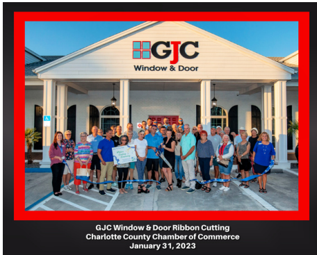
GJC Window & Door Ribbon Cutting Charlotte County Chamber of Commerce January 31, 2023