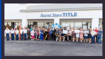
Burnt Store Title & Escrow - Ribbon Cutting Charlotte County Chamber of Commerce February 16, 2023