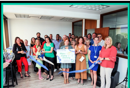
Restoration Bar Ribbon Cutting Charlotte County Chamber of Commerce March 29, 2023