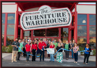
The Furniture Warehouse - Ribbon Cutting Charlotte County Chamber of Commerce February 28, 2023