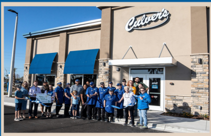
Culver's of Punta Gorda - Ribbon Cutting Charlotte County Chamber of Commerce February 7, 2023