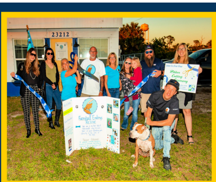
Fairytale Endings Rescue Ribbon Cutting Charlotte County Chamber of Commerce January 11, 2023