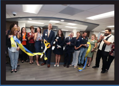
HCA Florida Fawcett Hospital - Ribbon Cutting Charlotte County Chamber of Commerce January 4, 2023