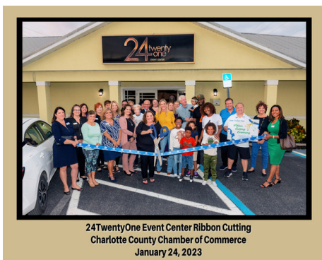
24TwentyOne Event Center Ribbon Cutting Charlotte County Chamber of Commerce January 24, 2023