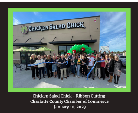
Chicken Salad Chick - Ribbon Cutting Charlotte County Chamber of Commerce January 10, 2023