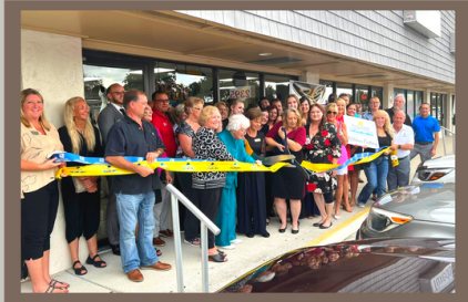
Charlotte Bridal Boutique & Formalwear - 20 Year Celebration and Ribbon Cutting Charlotte County Chamber of Commerce July 6, 2022