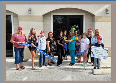
Stepping Stone Kids Therapy - Ribbon Cutting Charlotte County Chamber of Commerce July 7, 2022