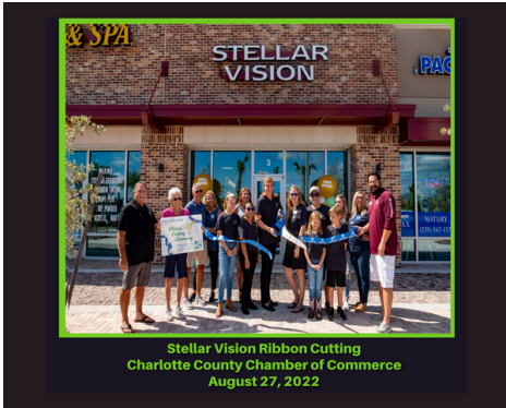
Stellar Vision Ribbon Cutting Charlotte County Chamber of Commerce August 27, 2022