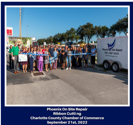
Phoenix On Site Repair Ribbon Cutting Charlotte County Chamber of Commerce September 21st, 2022