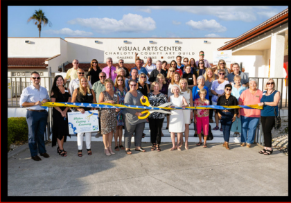
Visual Arts Center Ribbon Cutting November 1st, 2022 Charlotte County Chamber of Commerce