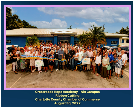
Crossroads Hope Academy - Nix Campus Ribbon Cutting Charlotte County Chamber of Commerce August 30, 2022