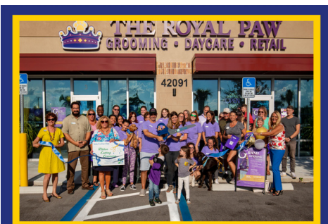
The Royal Paw Ribbon Cutting Charlotte County Chamber of Commerce August 17, 2022