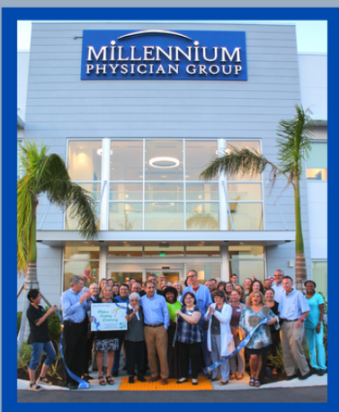
Millennium Physician Group - Ribbon Cutting Charlotte County Chamber of Commerce December 1, 2022