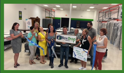
Boxdrop Mattress Port Charlotte Grand Opening - Ribbon Cutting Charlotte County Chamber of Commerce November 15, 2022