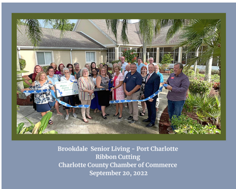
Brookdale Senior Living - Port Charlotte Ribbon Cutting Charlotte County Chamber of Commerce September 20, 2022