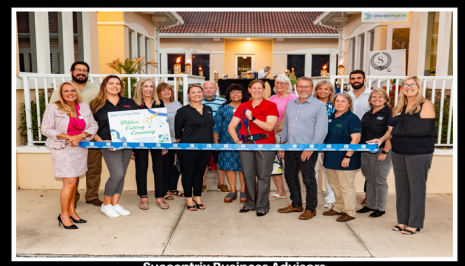
Succentrix Business Advisors Ribbon Cutting Charlotte County Chamber of Commerce December 6th, 2022