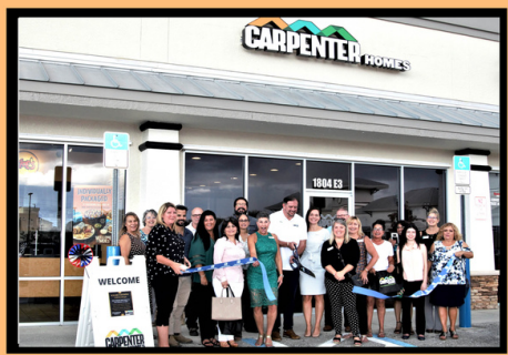
Carpenter Homes Ribbon Cutting Charlotte County Chamber of Commerce June 28th, 2022