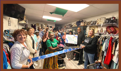
First Impressions Foundation Five Year Celebration - Ribbon Cutting Charlotte County Chamber of Commerce November 17, 2022