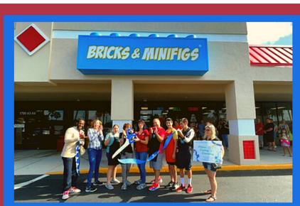
Bricks & Minifigs - Grand Opening & Ribbon Cutting Charlotte County Chamber of Commerce July 16, 2022