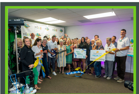
ActivAge Home Care Ribbon Cutting Charlotte County Chamber of Commerce August 18th, 2022