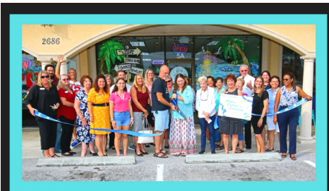
Two Angels Soaps Gallery & Gifts - Ribbon Cutting Charlotte County Chamber of Commerce July 16, 2022