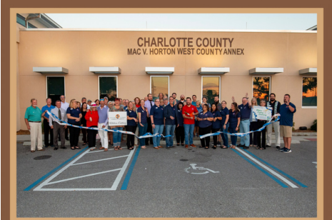
Charlotte County Clerk of Courts Englewood Annex Ribbon Cutting December 7th, 2022