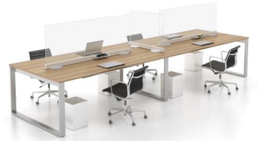
NEW PORT HIGH FREESTANDING.

Work space dividers that blend function and style to bring peace of mind and comfort to open work spaces.