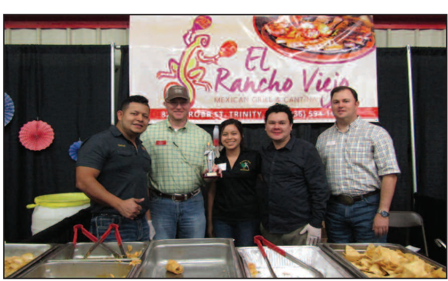
El Rancho Viejo won Best Food Booth