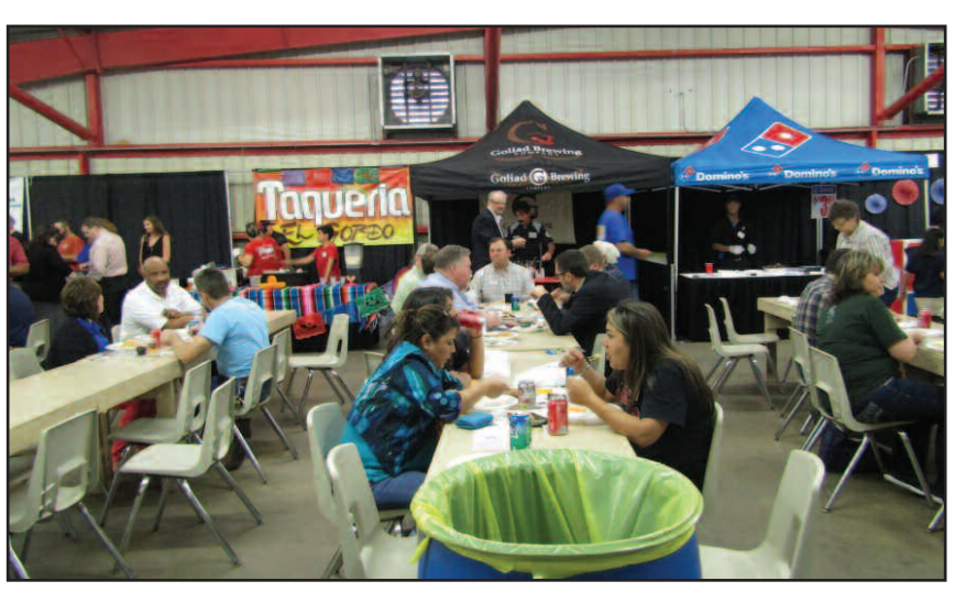
Many people enjoyed the Taste of Huntsville