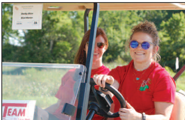
Junior Service League volunteers