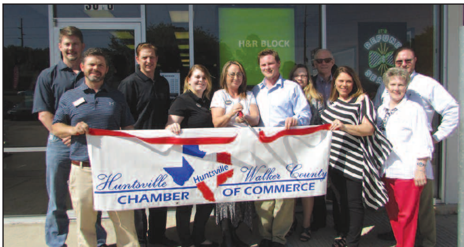
H & R Block - Huntsville

H & R Block-Huntsville - located at 3010 Highway 30W, Suite A, celebrated their Ribbon Cutting ceremony with Staff, Chamber Members, and Ambassadors on April 6, 2016. If you are looking for a tax professional who can handle all your tax preparation needs, give them a call at 936-295-8831 or visit their website at www.hrblock.com