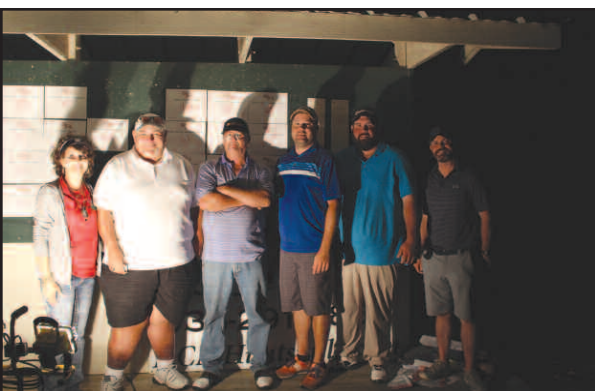
2nd flight 1st place winner - Team Sherwin Williams