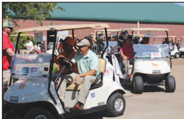
Teams head out for the 1st round of play!