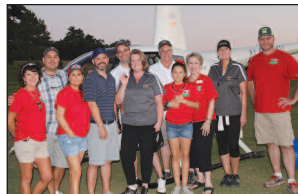
#54 was the lucky ball at the Helicopter Golf Ball Drop purchased by Texas Grand Ranch!!