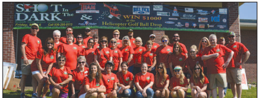
It takes a LOT of volunteers to make this tournament run so smoothly. We appreciate ALL of them. Please note that not all are pictured, some were out on the course working!