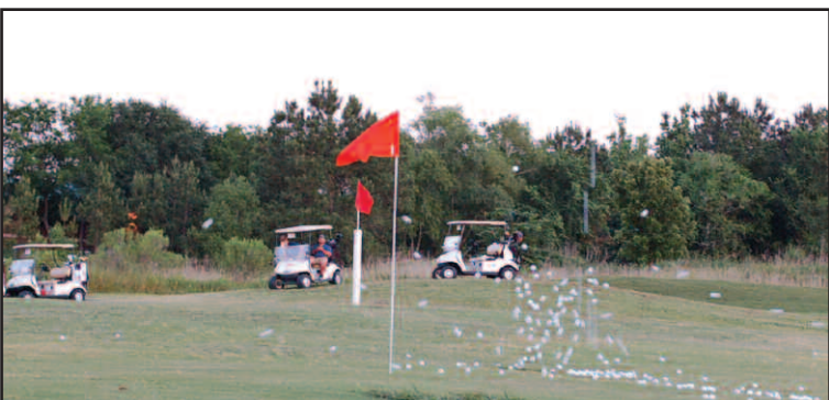
It's raining golf balls