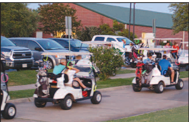
Glow in the dark accessories help light up the course, the players and the carts!