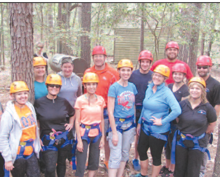
ROPES Day is always a big highlight!