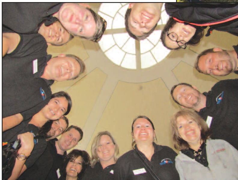
HLI Class 34!