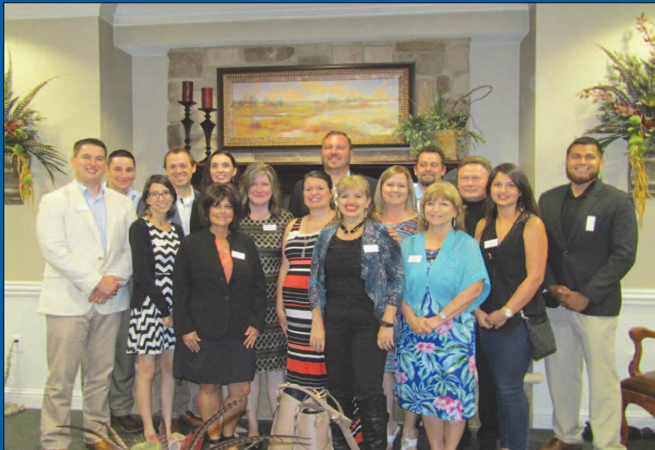
Class #34 of Huntsville Leadership Institute at Graduation, June 2, 2016