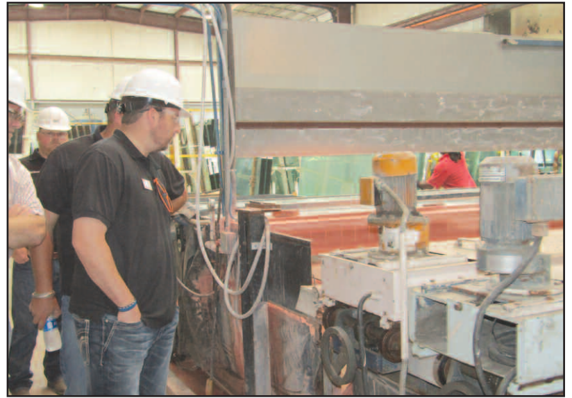
Learning how mirrors are made at Gardner Glass

There are no minimum educational requirements to apply. You do not have to be a member of the Chamber of Commerce, nor employed. To request an application or more information contact the Chamber at 936-295-8113.