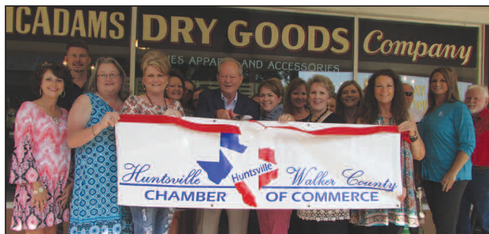
McAdams Dry Goods

Crossin Moving & Storage - celebrated their Ribbon Cutting ceremony with Chamber Members, and Ambassadors on May 12, 2016. A family -owned business that takes great pride in ensuring your piece-of-mind as you focus on establishing your new home or business. For more information call 936-967-5660, or visit their website at www.crossinmoving.com