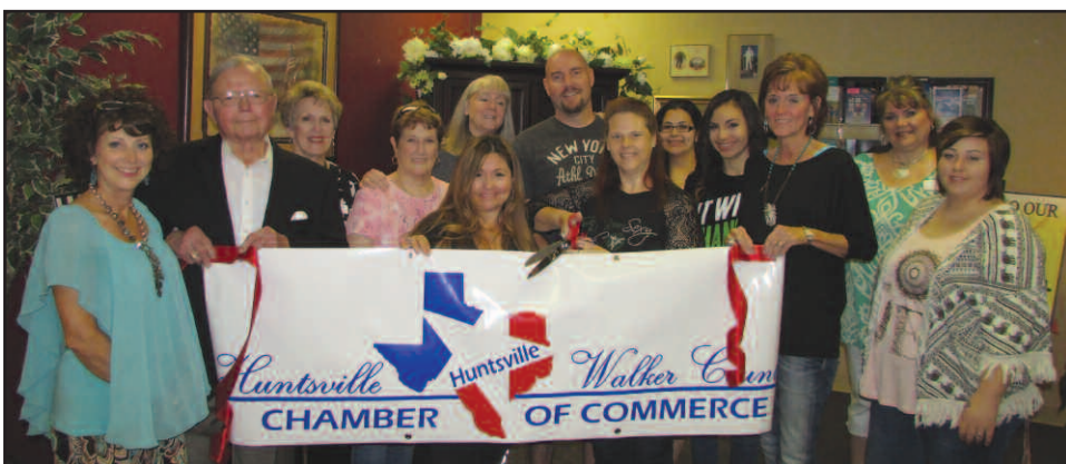
It Works - Mary Kay Landgolf