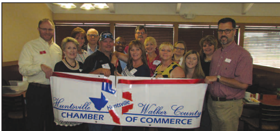
Crossin Moving & Storage

City Hall Cafe & Pie Bar - located at 1421 Sam Houston Avenue, celebrated their Ribbon Cutting ceremony with Staff, Chamber Members, and Ambassadors on May 11, 2016. They offer a variety of entrees, sandwiches, salads and appetizers as well as their "famous" deep dish pies, cobblers and mini pies. Give them a call at 936-439-6113, or visit their website at www.cityhalltexas.com