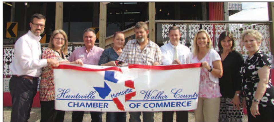
City Hall Cafe & Pie Bar