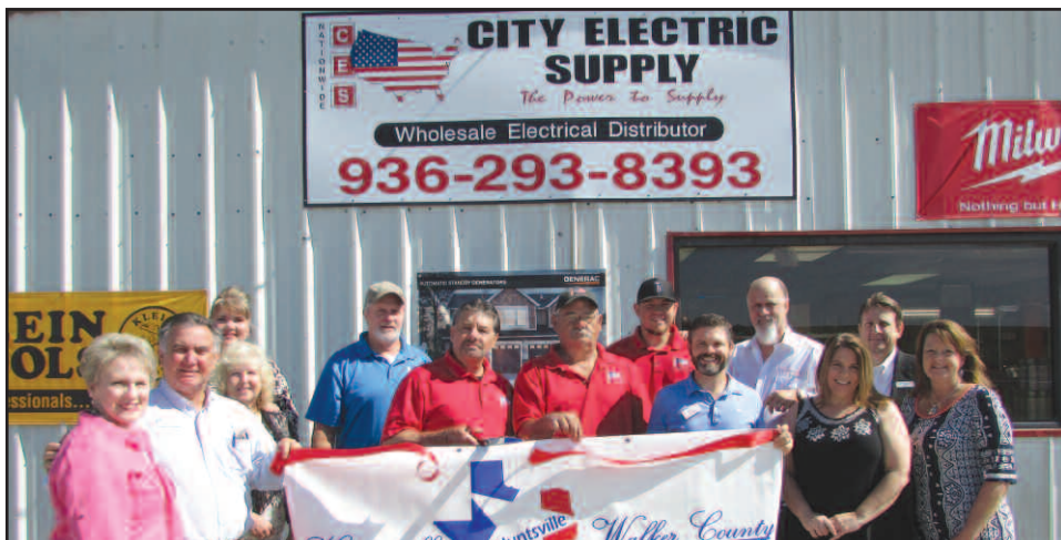
City Electric Supply

City Electric Supply - located at 420 FM 2821 celebrated their Ribbon Cutting ceremony with Staff, Chamber Members, and Ambassadors on May 4, 2016. A family owned electrical wholesale distributor that provides quality supplies for customers in the residential, commercial, and industrial markets. Give them a call at 936-293-8393, or visit their website at www.cityelectricsupply.com