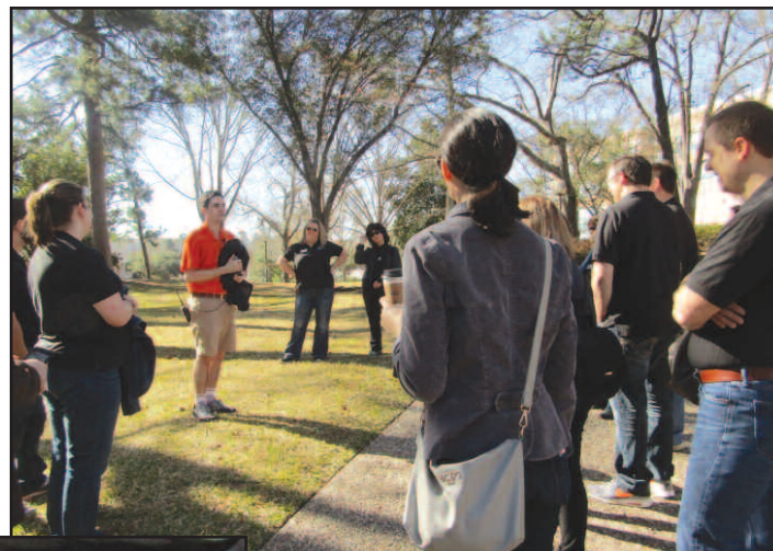
Visiting SHSU Campus