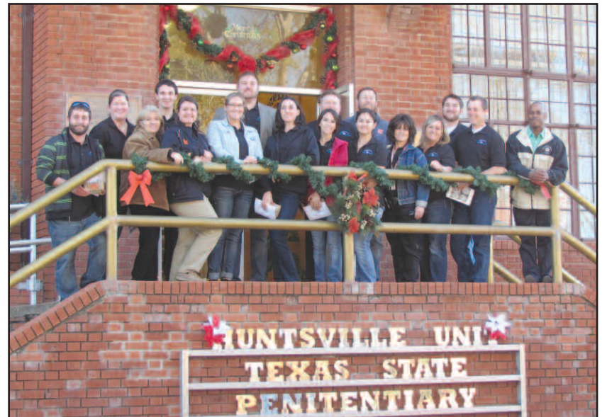
Criminal Justice Day at the historical "Walls" Unit