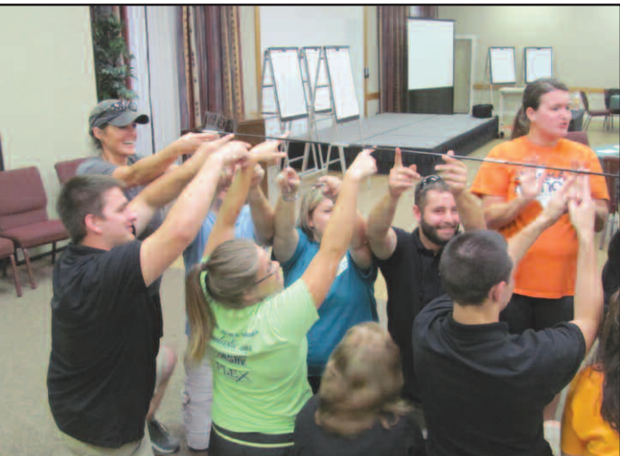
Games @ Retreat