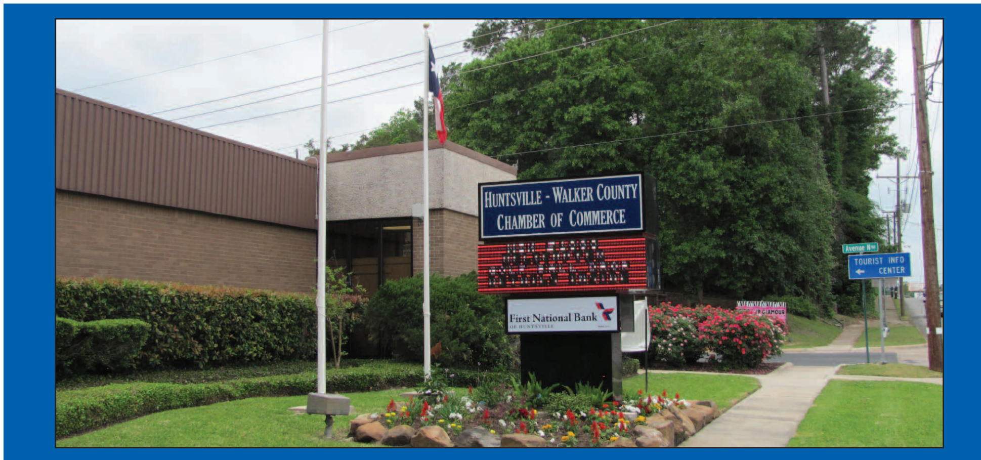
Huntsville - Where A Warm Welcome Awaits