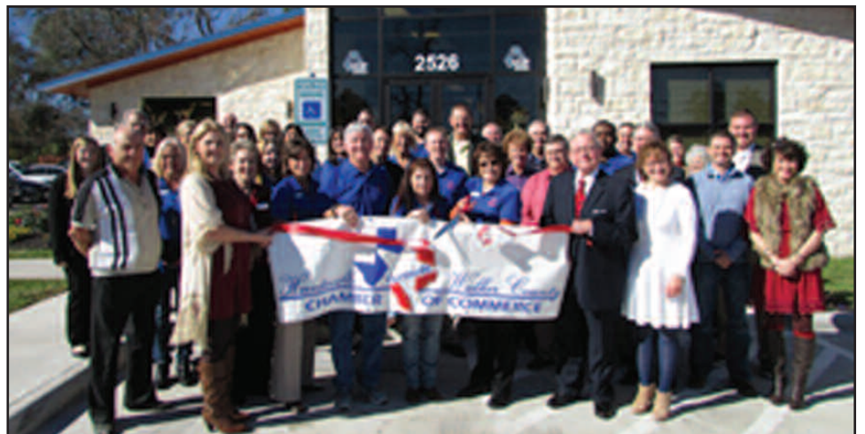
Community Service Credit Union

Community Service Credit Union - The newest location at 2526 Montgomery Rd. celebrated their ribbon cutting ceremony with Chamber Members and Ambassadors on December 17, 2015. Whether you want to open an account, apply for a loan, or check out their percentage rates, give them a call at 936-295-3980, or visit their website at www.cscutx.com