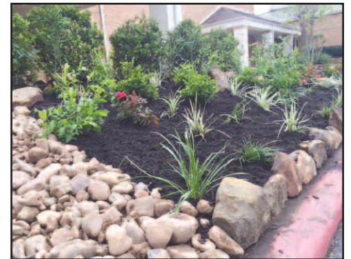
Rockin' D Services