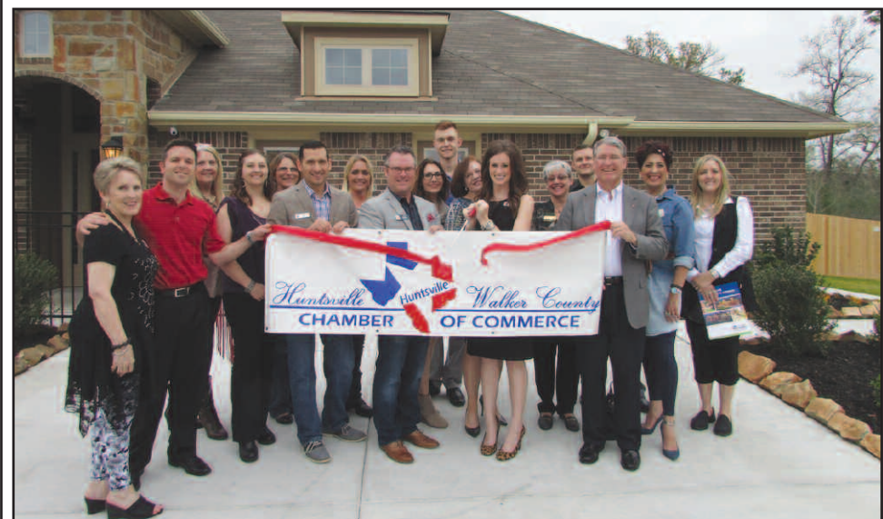
StyleCraft Builders, Inc.