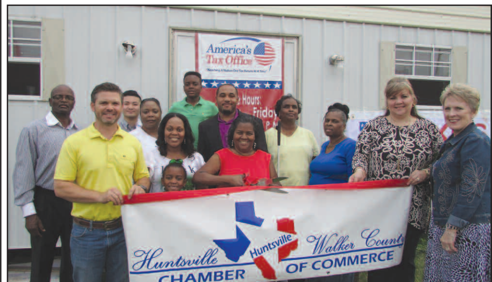
America's Tax Service