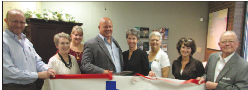
Texas Custom Awards and Promotions

ALREADEE Delivery Service - Along with Chamber Staff, and Ambassadors celebrated their Ribbon Cutting ceremony on August 17, 2016. Your inconvenience is their Convenience! Specializing in delivering from any restaurant in Huntsville to your front door where you can enjoy your meal in the comforts of your home. For more information, please call 936-662-2647.