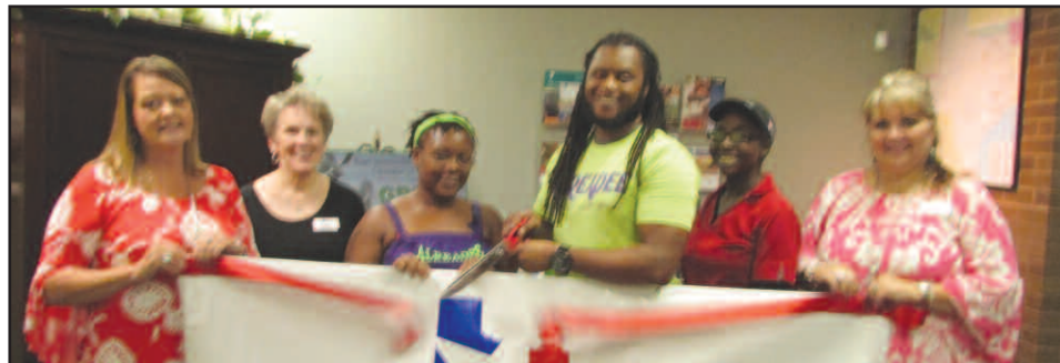
ALREADEE Delivery Service

Baking Sweet Memories - celebrated their Ribbon Cutting ceremony with Staff, Chamber Members, and Ambassadors on August 17, 2016. Huntsville's only Gourmet Cupcake Shop located at 1114 10th St. offers cakes, cookies, wedding cupcakes, breads and other treats. If you are looking for that "Special" treat for your loved one, or just for yourself, give them a call at 936-755-8175.