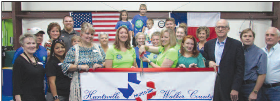
Kid's Spot Trampoline & Tumbling

Kid's Spot Trampoline & Tumbling - celebrated their Ribbon Cutting ceremony with Staff, Friends, Chamber Members, and Ambassadors on August 9, 2016. They strive to give young athletes a positive, safe, working atmosphere to develop the child's individual abilities and skills, by offering Trampoline and Tumbling . Stop by and visit their location at 176 State Highway 19, or give them a call at 936-436-9133.