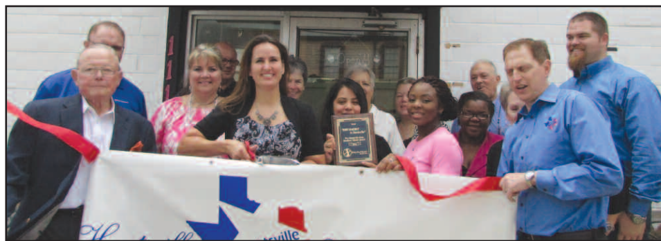
Baking Sweet Memories

Baking Sweet Memories - celebrated their Ribbon Cutting ceremony with Staff, Chamber Members, and Ambassadors on August 17, 2016. Huntsville's only Gourmet Cupcake Shop located at 1114 10th St. offers cakes, cookies, wedding cupcakes, breads and other treats. If you are looking for that "Special" treat for your loved one, or just for yourself, give them a call at 936-755-8175.