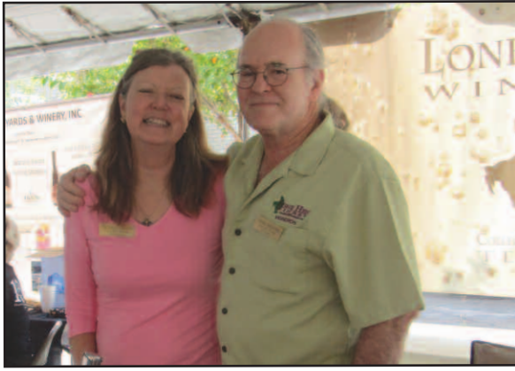
Lone Hen Winery, one of the 12 Vineyards that were in the Wine Knot Wine Tasting! Thanks to Wiesner, Inc. Huntsville for sponsoring the Wine Knot!