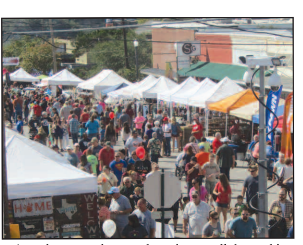
Attendance was large and continuous all day at this year's event. Thanks to everyone who came out!