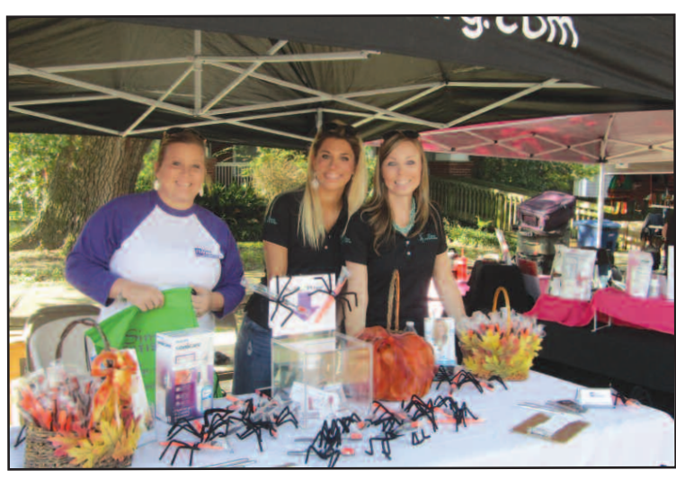
Sims Dentistry from Huntsville Texas!