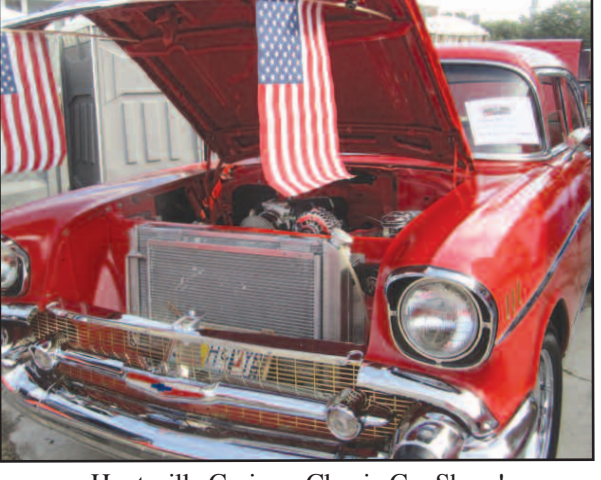
Huntsville Cruisers-Classic Car Show!