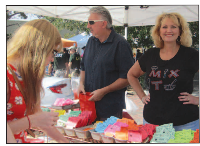
Mix It from Shoreacres Texas!