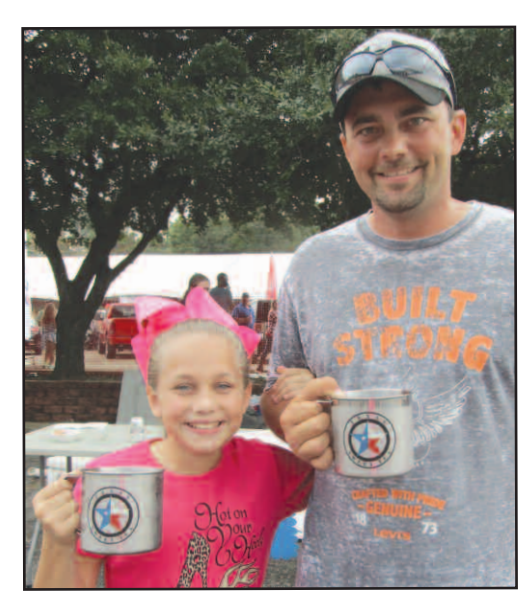
Enjoying drinks from Wild Bill's Old Fashioned Soda - Dripping Springs, Texas!