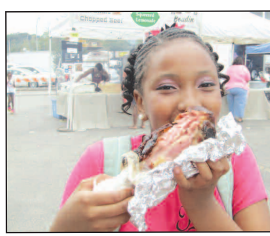
The food at the Fair on the Square is always a crowd