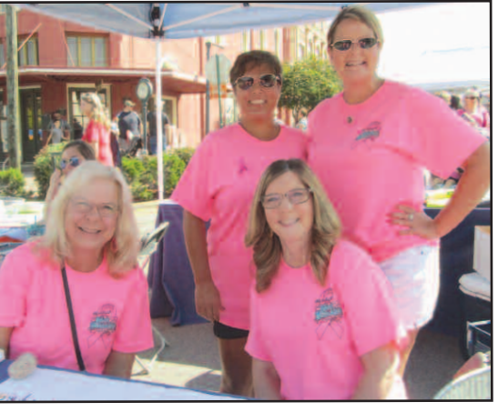
more than 200 volunteers to keep the Fair on the Square running smoothly.