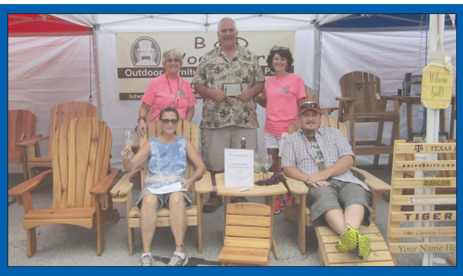
Congratulations to B & D Woodworx for receiving the Best Booth Award at the 2016 Fair on the Square!