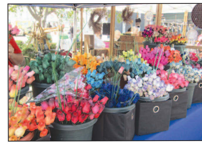
Kirby's Crafts from Ore City Texas!