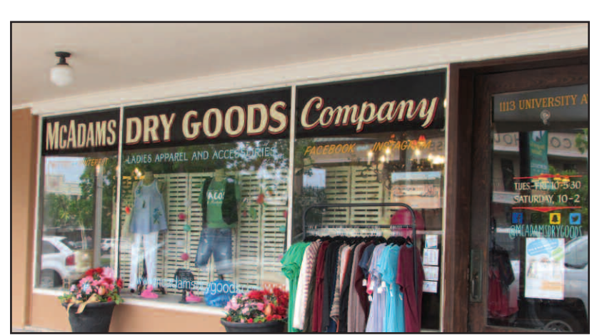
McAdams Dry Goods - new on the downtown square