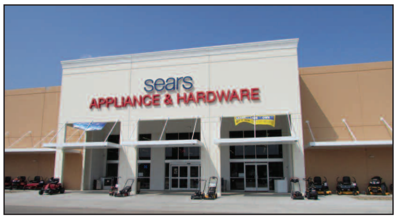
New Sears Retail Center