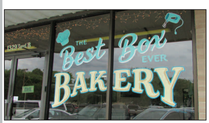
The Best Box Ever Bakery