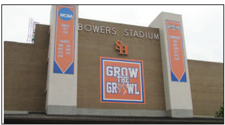
Athletics is a big "draw"

We have experienced many exciting changes in Huntsville and Walker County during the past few years and 2017 looks to be another big sectors. We are seeing many local businesses opening as commercial property is developed. This is important for our community for a improve local infrastructure, such as schools, roads, parks, libraries and emergency services. 2) Job Development--growth in our commu base will help expand our economy and reduce our reliance upon any single business sector and 4) Quality of life--the increase in local t opportunity to live in a community that is rich in Texas history, rich in natural resources and most of all rich in people wl