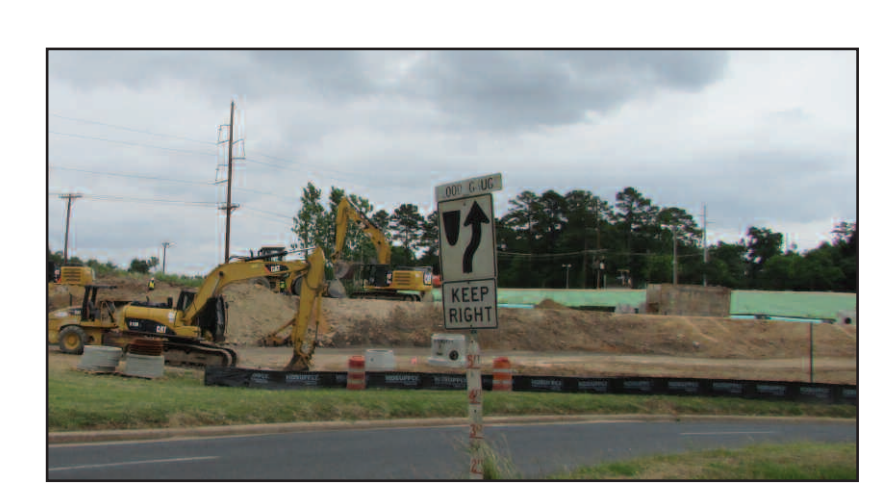
New parking for SHSU