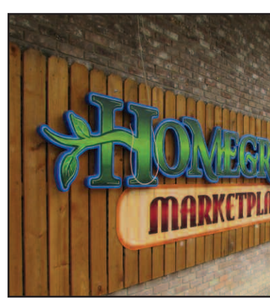
Homegrown Marketplace - new nan