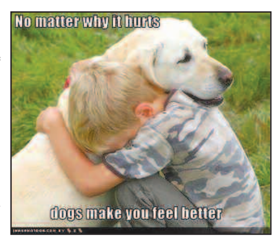
Huntsville Pets Helping People

Huntsville Pets Helping People organization's Mission Statement is as follows, "To help people through beneficial contacts with companion therapy animals and to deliver quality animalassisted activity and therapy programs, to unite people who have mental and physical disabilities and patients in healthcare facilities with professionally trained animals in order to help improve their health, to promote education to