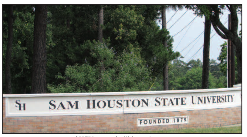
SHSU-many facilities going up