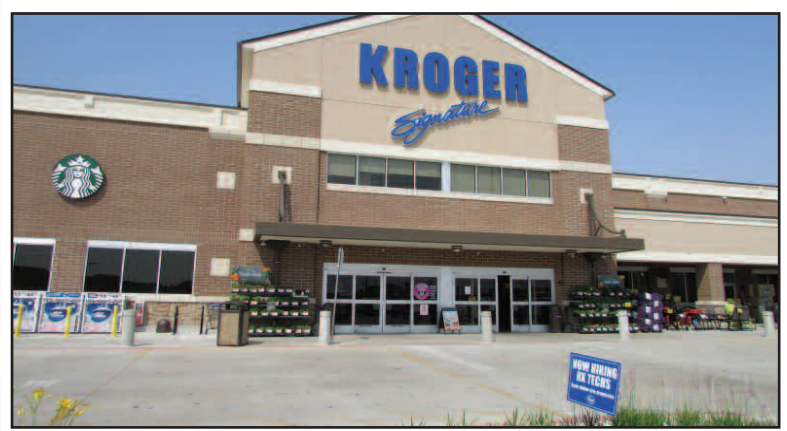
Kroger's new store