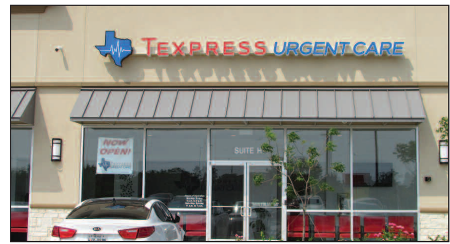
Texpress Urgent Care - new to Huntsville