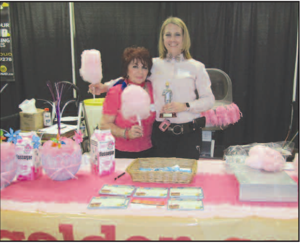
Golden Coral won Best Food Booth Award