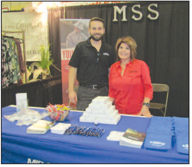
$500 Grand Prize Sponsor