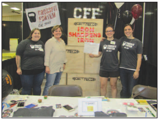
CrossFit Fortem won Best Booth Award

le at the Walker County Fairgrounds on Thursday, March 2, 2017. Also included was a Children's Play area, along with new and classic cars. A rrysler Jeep, Wiesner, Inc.-Huntsville, Huntsville ISD, Mid-South Synergy, Sam's Club, FASTSIGNS, Newman Printing and Gold Cloud.