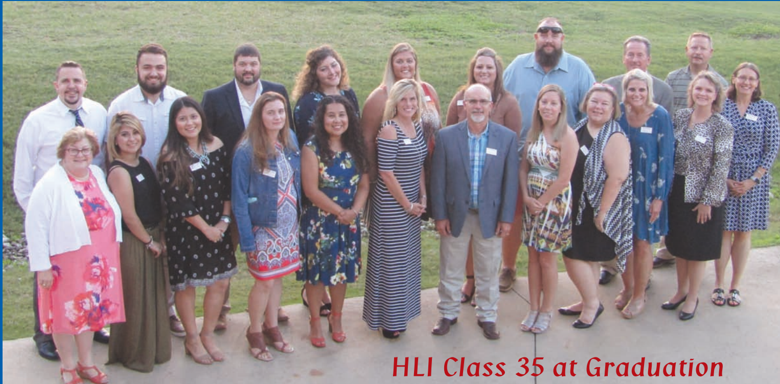
HLI Class 35 at Graduation