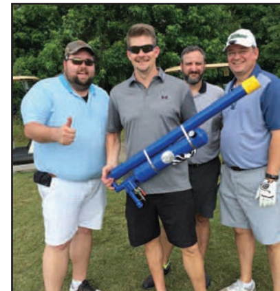
14th Annual Shot in the Dark Night Golf Tournament The Huntsville-Walker County Chamber of Commerce Raven Nest Golf Club, Huntsville, Texas Friday, May 19, 2017 -1214-1471 www.mhkgolf.com "Putting the FUN into Fund-Raising!" TEAM DODGE ♦ CHRYSLER ♦ JEEP HUNTSVILLE, TEXAS Presenting Sponsor